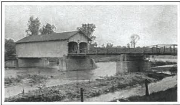
Main Street crossed the Huron River via a covered bridge built in 1836-1837. The landmark bridge was far too frail to support interurban cars and was replaced in 1910.

MEMORIAL DAY INDEPENDENCE DAY LABOR DAY COLUMBUS DAY