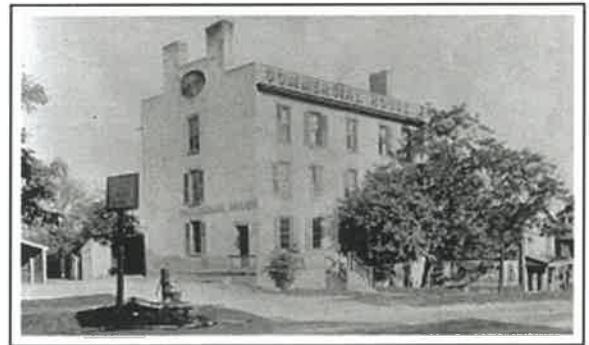
The Railroad House hotel was built circa 1834 on the site of a previous 1818 hotel. It was named the Commercial House by the time this photo was captured in 1896.

Learn more about our historical railway system and other Monroeville landmarks by visiting http://www.lakeshorerailmaps.com/monroeville.html .