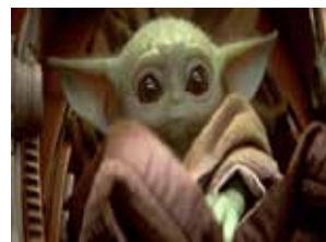
Before tax season