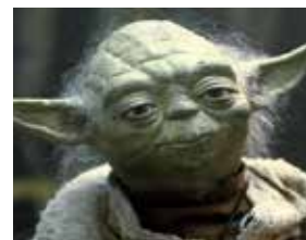
After tax season